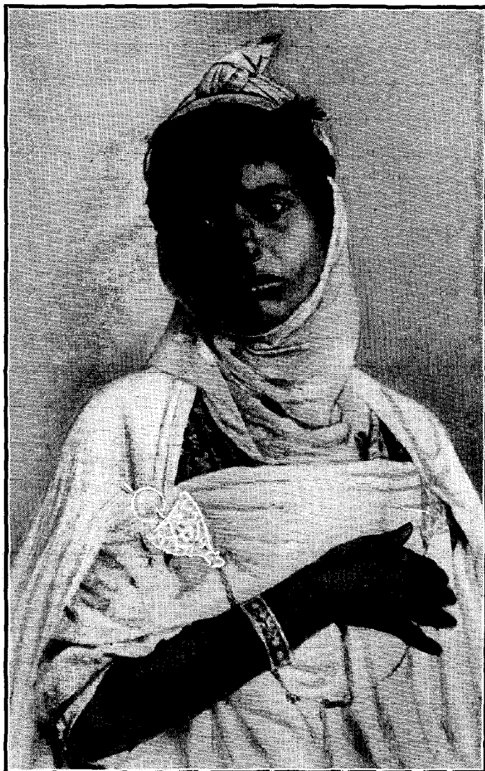
A CRY OF DISTRESS FROM ALGIERS