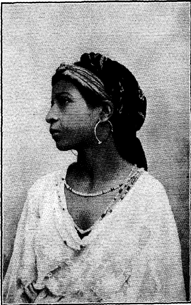
A YOUNG GIRL OF THE ABU SAAD TRIBE