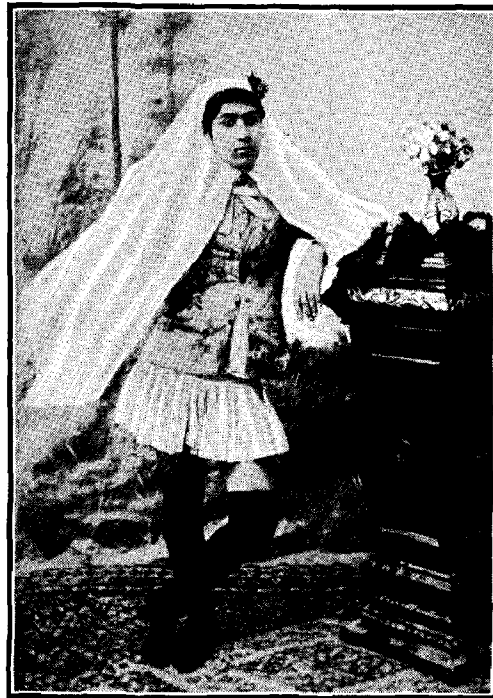
INDOOR DRESS (NORTHERN PERSIA)