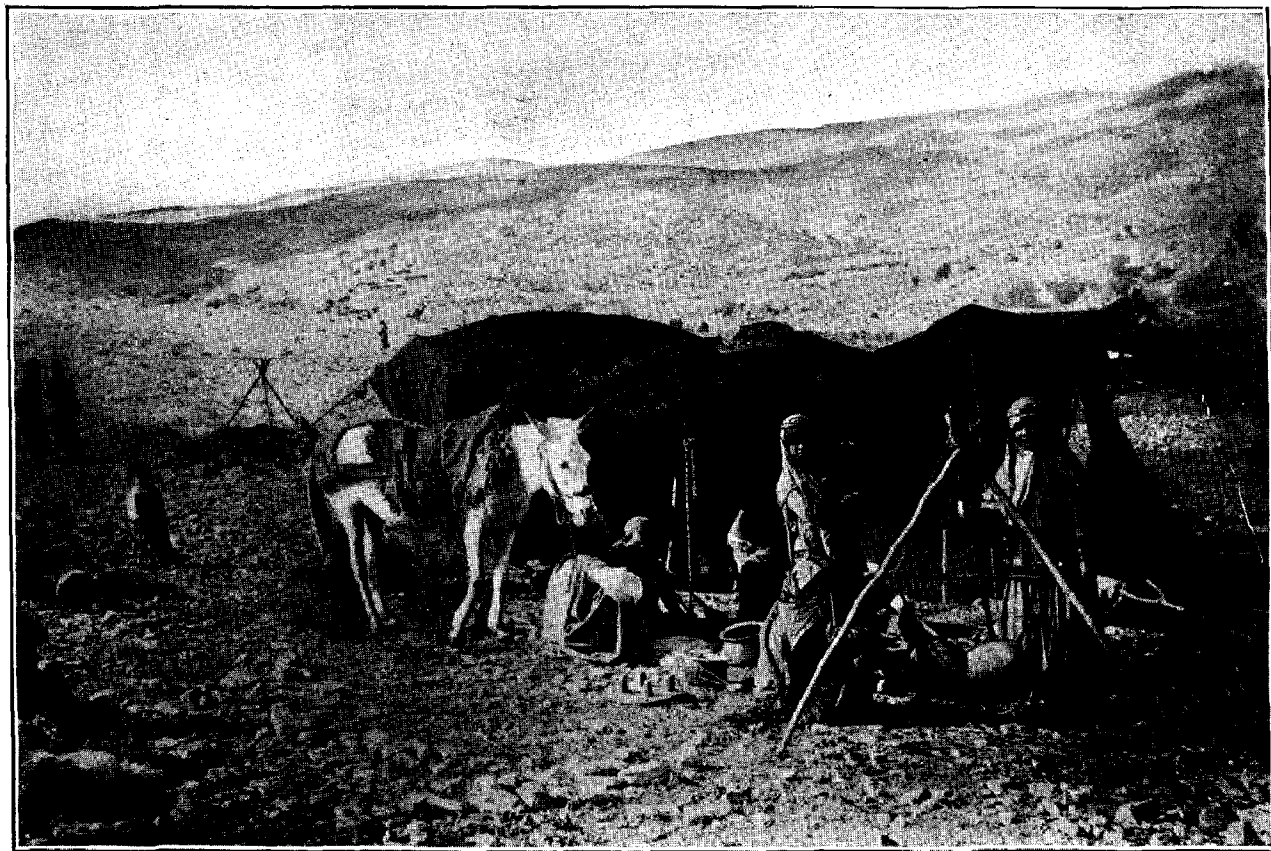
CHURNING BUTTER IN A BEDOUIN CAMP