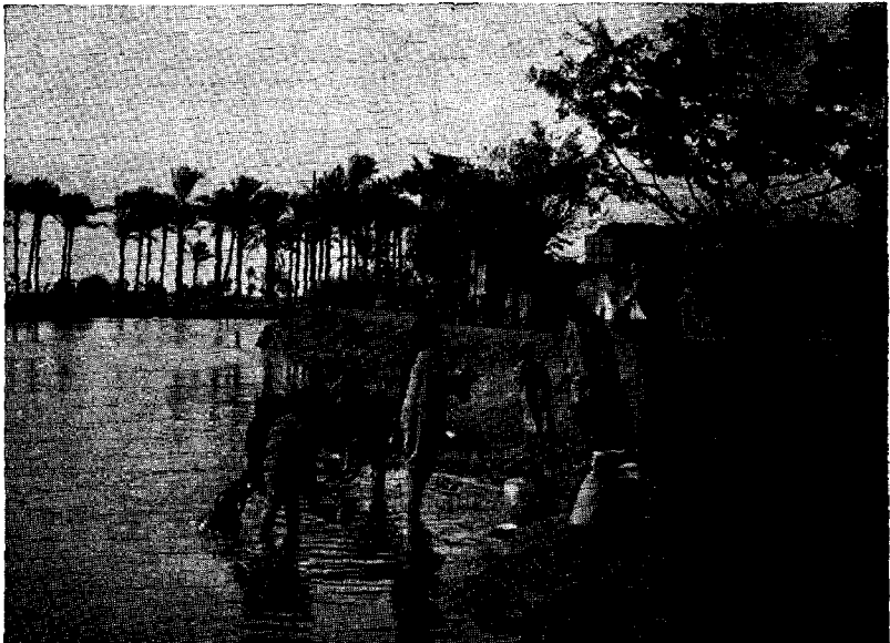
BY THE BANKS OF THE NILE