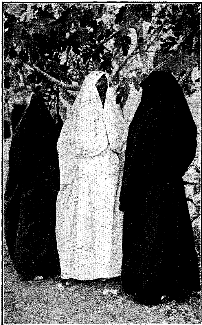
MOSLEM WOMEN OF THE BETTER CLASS IN STREET DRESS (SYRIA)