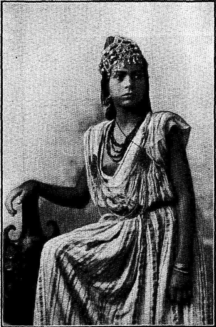
A BEDOUIN GIRL FROM NORTH AFRICA