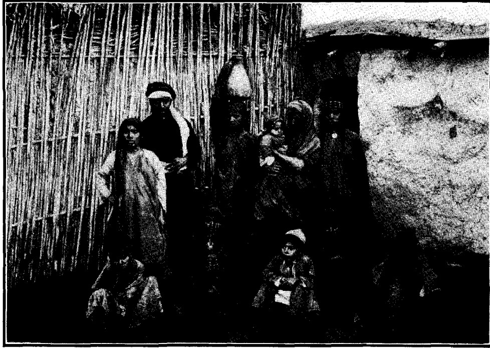
A FAMILY GROUP AT JERICHO