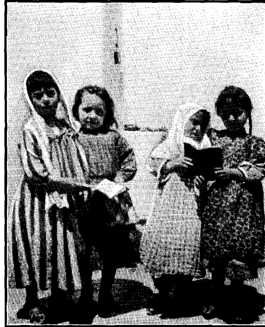
MOSLEM AND CHRISTIAN GIRLS READING TOGETHER