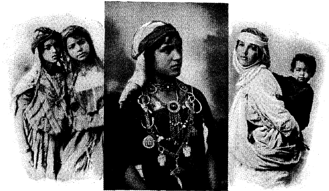
TYPES IN TUNIS AND ALGIERS