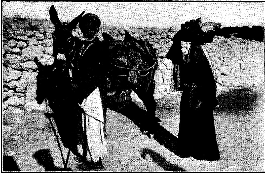
GOING TO MARKET. TWO BURDEN BEARERS