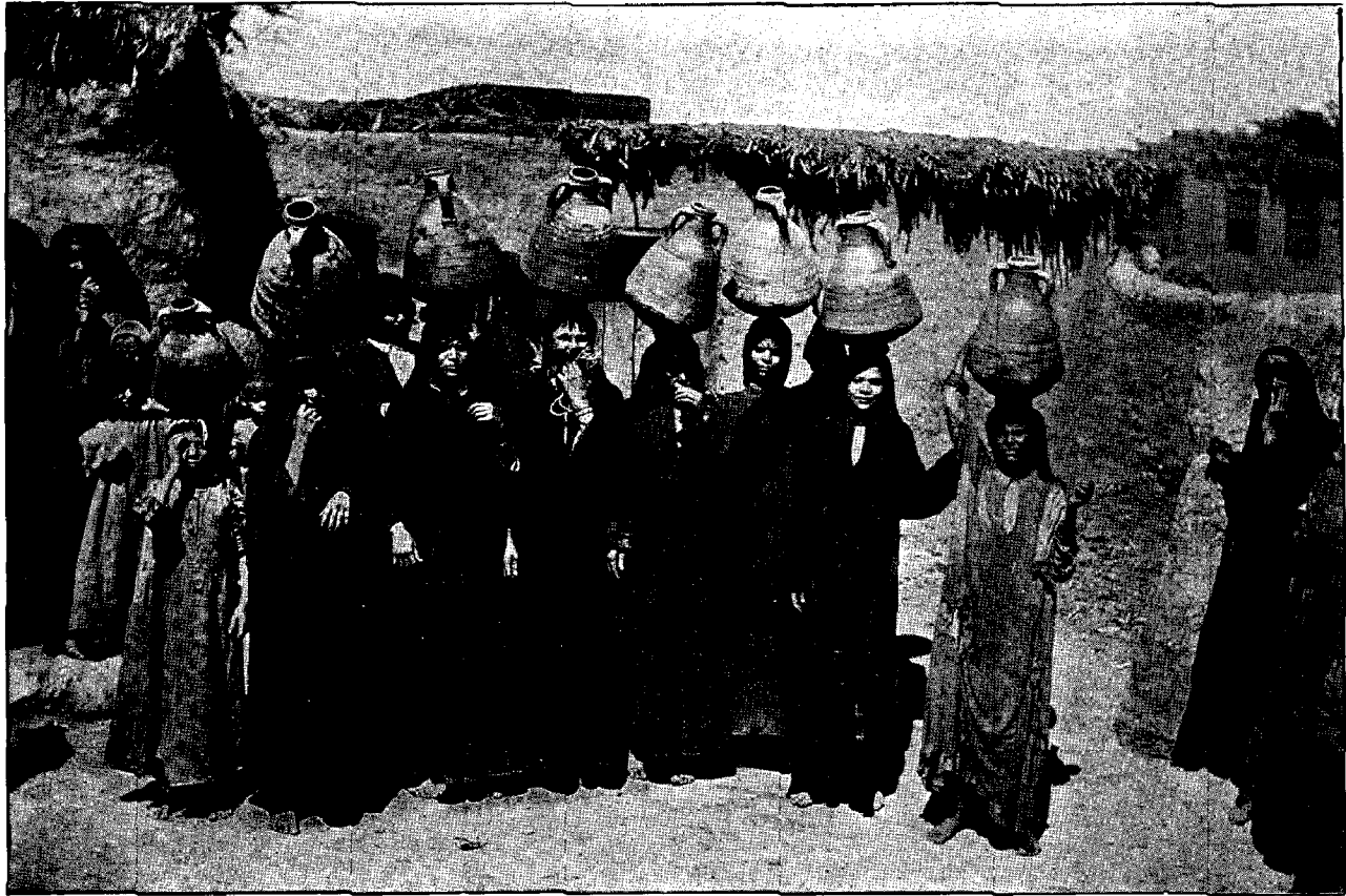
DAUGHTERS OF EGYPT