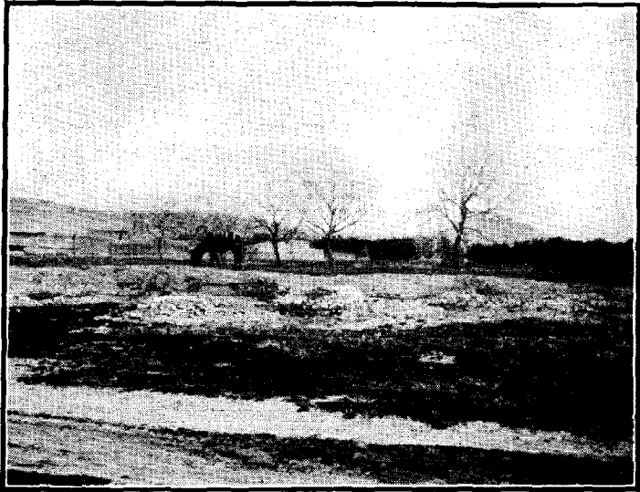
A MOSLEM CEMETERY