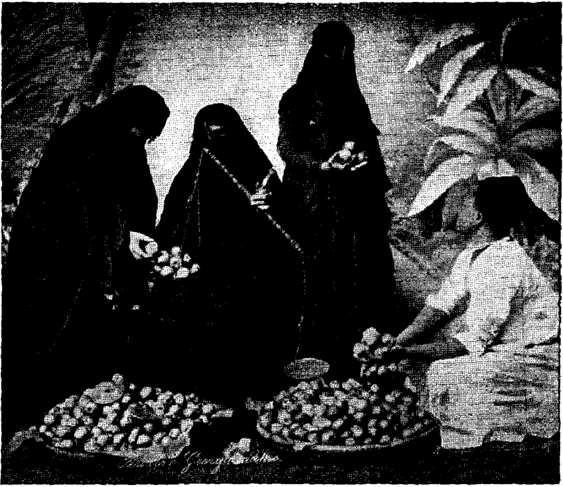
BARGAINS IN ORANGES