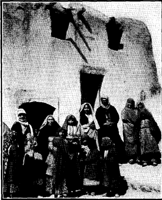
A VILLAGE SCHOOL IN SYRIA